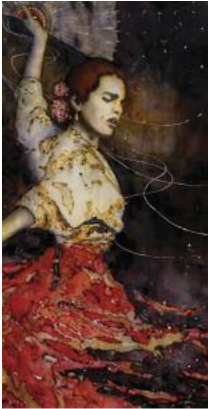
LEFT La Vida Breve 2006, watercolor and acrylic, 60 x 30. Private collection.