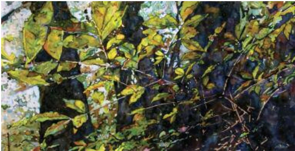
LEFT Sueño del Verde 2008, watercolor, 27 x 52. Collection the artist.