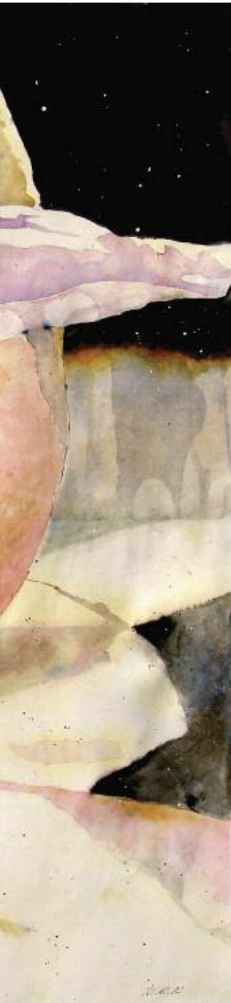
LEFT Ma Belle Amie 2006, watercolor, 41 x 41. Collection the artist.