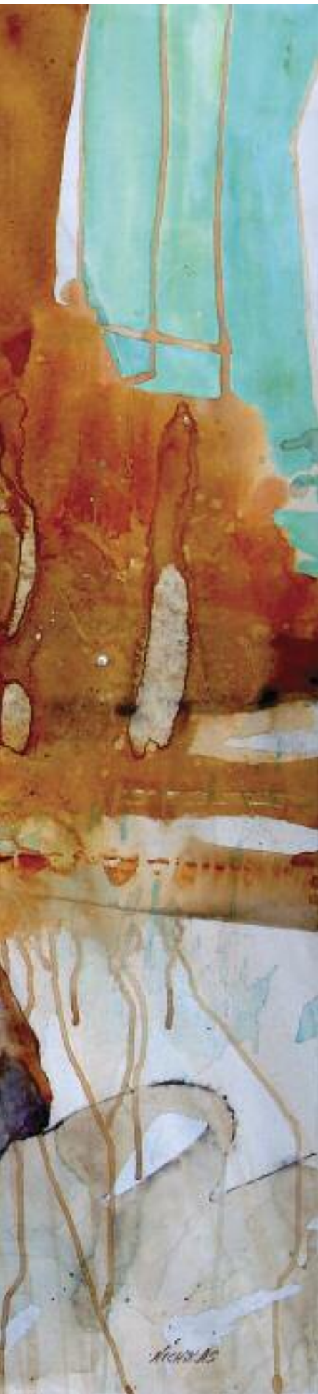
LEFT Nassau No. 4: Bay St. Girl 2008, watercolor, 38 x 38. Collection the artist.