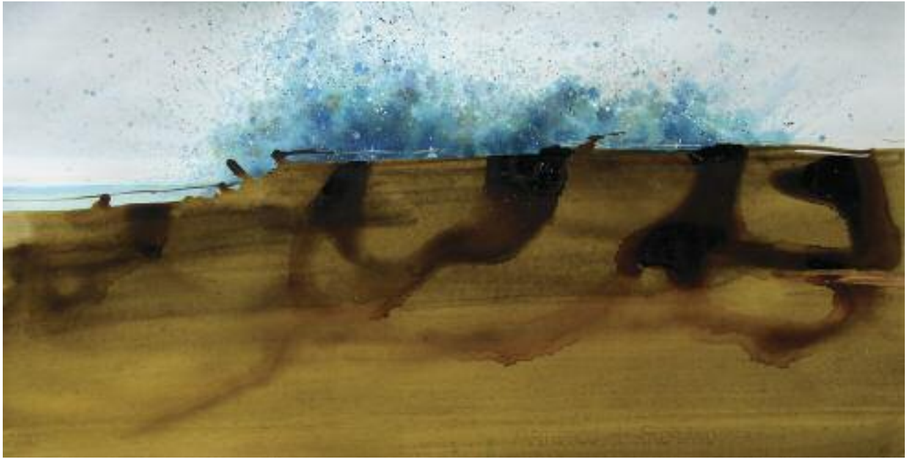
ABOVE Aegis II 2006, acrylic, 15 x 30. Collection the artist.